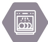
Foodservice & Hospitality Equipment