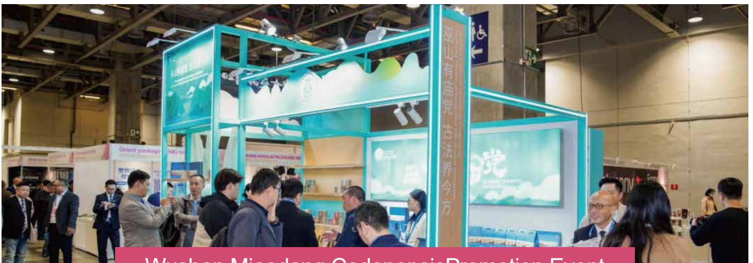
Wushan Miaodang Codonopsis Promotion Event

Substantive breakthroughs were made in the signing session: 32 units reached cooperation agreements, with the signed volume of Fengjie navel oranges, Chinese medicinal materials and other products exceeding 5,700 tons, laying a solid foundation for the export of Fengjie's characteristic agricultural products.