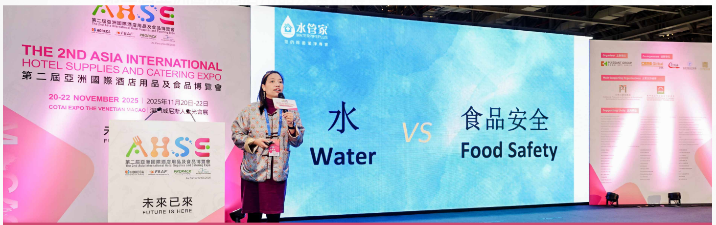
The importance of water quality and safety