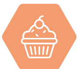
Bakery, Pastry & Gelato