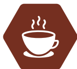
Coffee, Tea & Bar