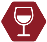
Wine & Spirits