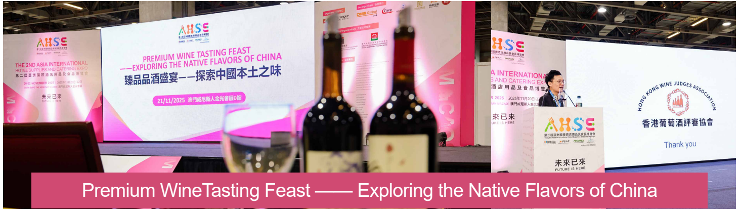
Premium Wine Tasting Feast — Exploring the Native Flavors of China