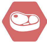
Meat & Poultry