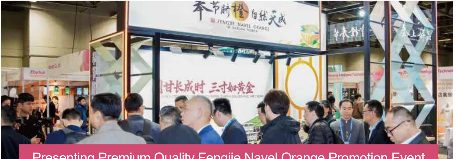
Presenting Premium Quality Fengjie Navel Orange Promotion Event