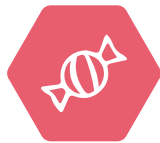
Snacks & Confectionary