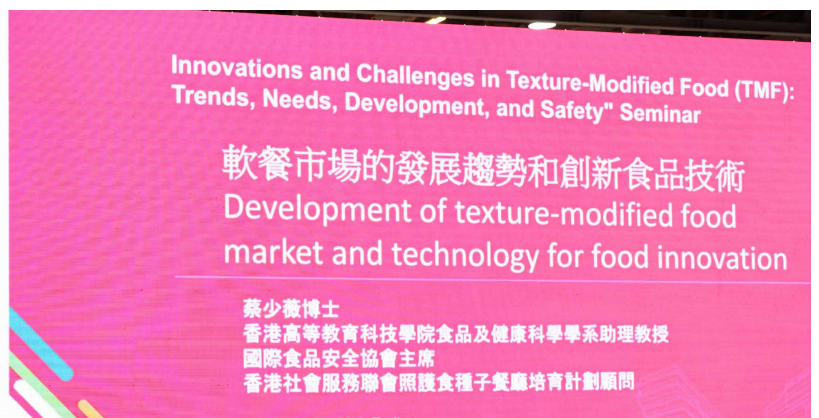
Latest trend in senior market and soft food: Innovation and development of care food