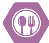
Tableware & Hospitality Supplies